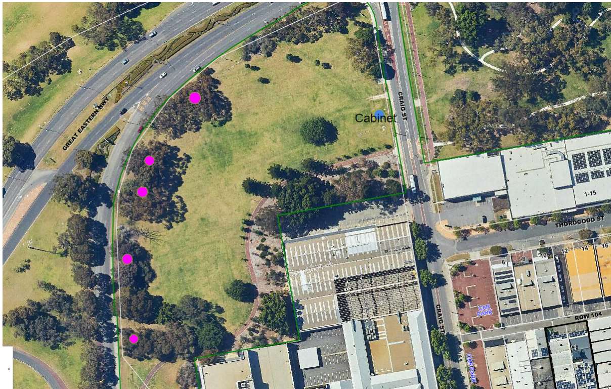
Charles Patterson Park