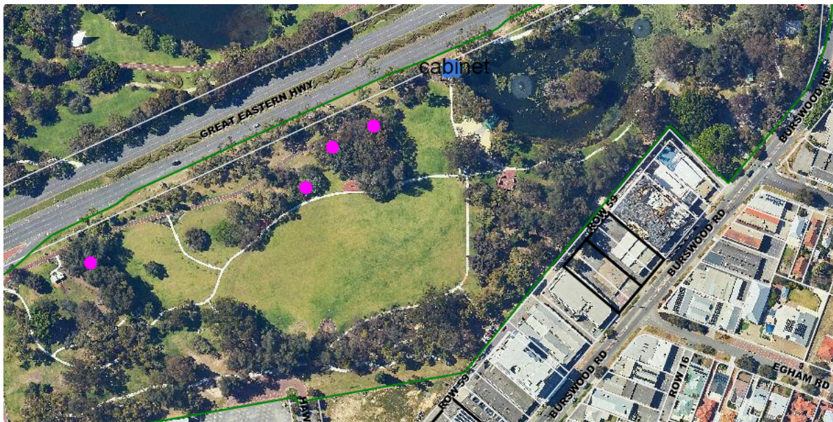
GO Edwards Park